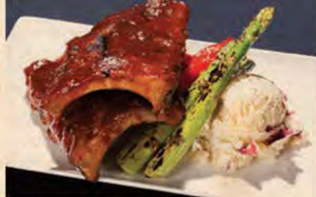
FULL RACK RIBS

Beef liver lightly floured and pan seared. Served smothered in sautéed onions with Maple Leaf bacon and rich brown gravy. Served with Chef's potato and vegetable of the day.