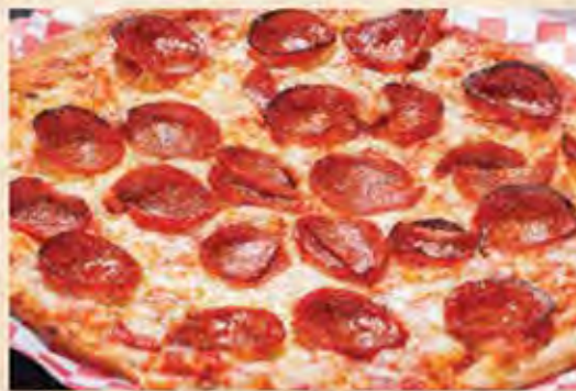
PEPPERONI CHEESE PIZZA