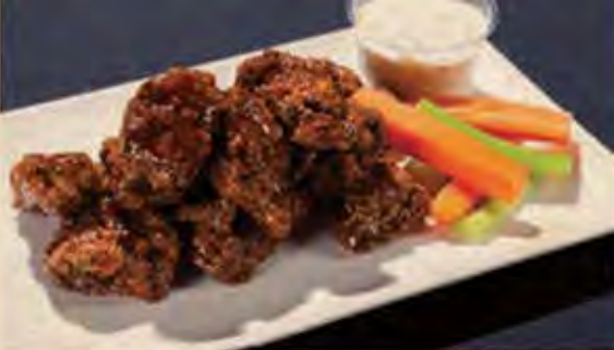
CRISPY PORK RIBLETS

Savory pork and vegetable filling rolled into a crisp eggroll skin. Served with sweet chili sauce.